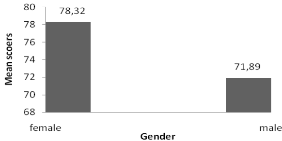
Figure 3. Student’s science process skills difference based gender in five schools of Langsa City

Total sample of students in five schools observed was 101 female students and 49 male students. Data analysis (Figure 3) shows science process skills of female students was in very high category (74,55), while male students in high category (71,59). Further analysis shows there was no significant difference of science process skills between male and female students in Langsa City.